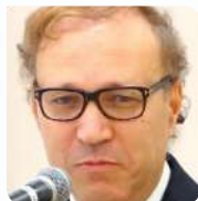
Ghaleb Bencheikh Secretary-General Islamologist, World Conference of the Religions for Peace