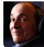
Philippe Pozzo di Borgo Writer