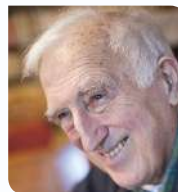
Jean Vanier Founder of L'Arche